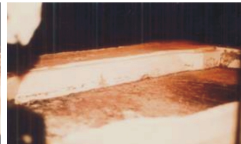
Coated with Alcoat

Die casting Holding Furnace after 6 Months operation