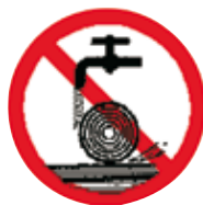
Do not use for wet grinding