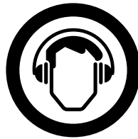
Use ear muffs