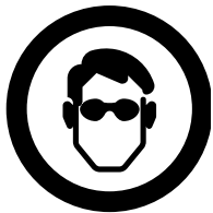
Wear safety glasses