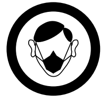
Wear a dust mask