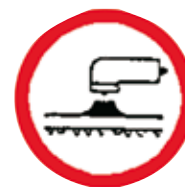
Do not use without back-up pad