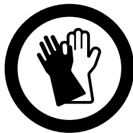
Wear safety gloves